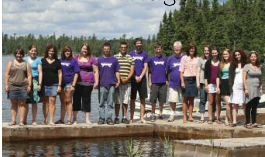
2010 Luther Village Staff, Dogtooth Lake ON